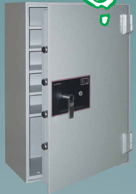
■ MODEL DS900